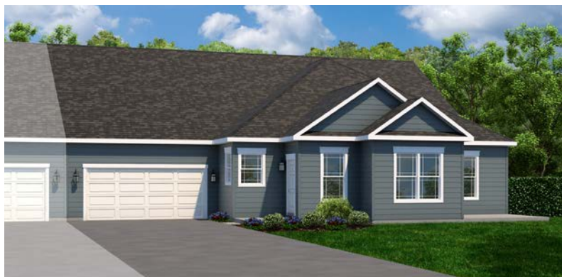
ELEVATION 2 SIDING