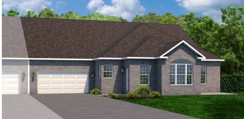
ELEVATION 9 BRICK

2 - 3 BED, 2 - 3 BATH, 2 CAR GARAGE 1,485 - 2,360 sq. ft.